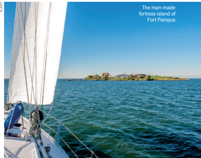
The man-made fortress island of Fort Pampus

"On a hot day, it's even better to take the boat up the Amstel river for a swim. I don't have my own boat, but you can rent them at Mokumboot"