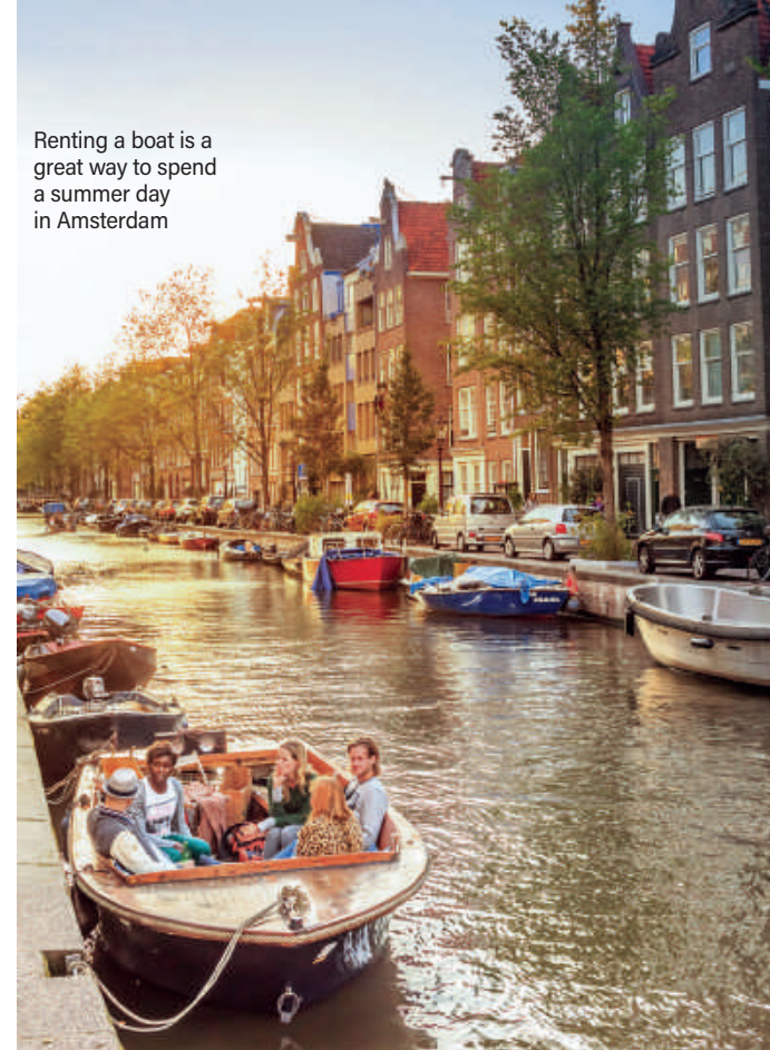
Renting a boat is a great way to spend a summer day in Amsterdam